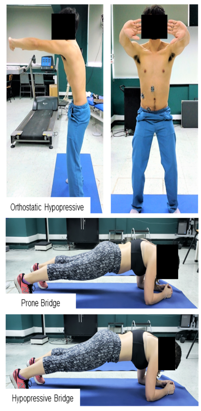
Figure 1. Orthostatic Hypopressive (OH), Prone Bridge (PB) and Hypopressive Bridge (HB) exercises.

Figure 1 shows a participant performing the PB, OH, HB exercises.