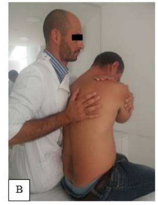
Figure 2. A: High velocity low amplitude technique. B: Low velocity joint mobilization technique.

Participants underwent the PFT in standing position, wearing a nose clip. During this, they were instructed to breathe normally into the spirometer for 30 seconds, sealed their lips around the mouthpiece, after which they were instructed to inspire maximally and then maximally expire as forceful as possible for six seconds so that FVC and FEV1 could be measured. Measures were completed in triplicate, allowing one minute between efforts, with the best results used for analysis. One minute after, participants completed a single MVV manoeuvre for 15 seconds.