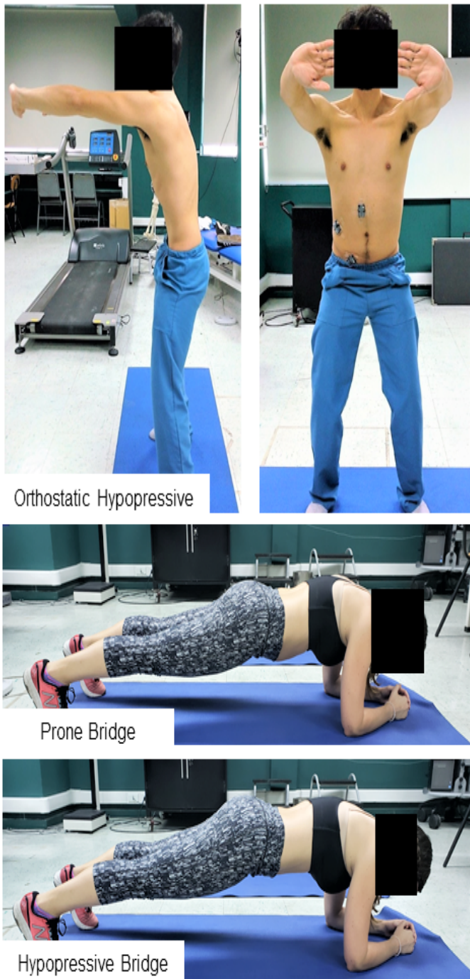
Figure 1. Orthostatic Hypopressive (OH), Prone Bridge (PB) and Hypopressive Bridge (HB) exercises.

Figure 1 shows a participant performing the PB, OH, HB exercises.