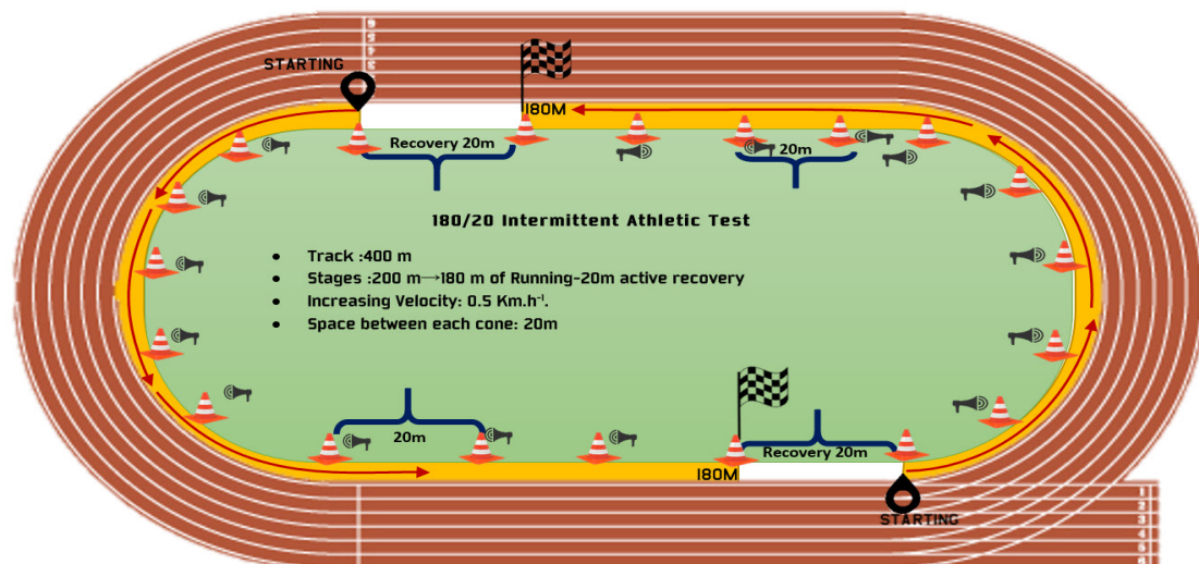
Figure 1. Material organization of the 180/20 intermittent athletic test

Figure 2A shows the linear regression between MAS VAM-T and MAS 180/20IAT , whereas Figure 2B presents the Bland and Altman plot of MAS obtained during both tests. Systematic bias (-0.10km.h -1 ) and limits of agreement (-1.69–1.48 km.h -1 ) are low.